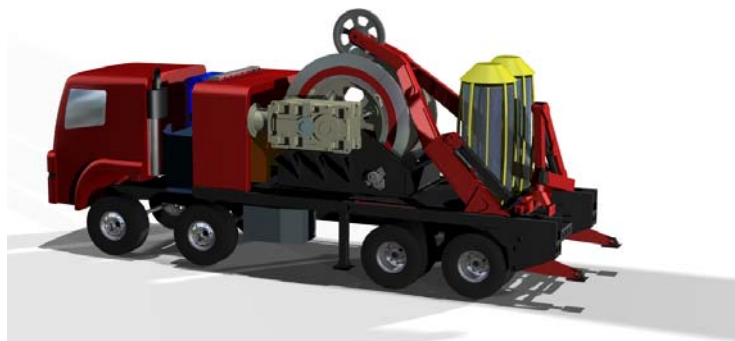
Sheave Wheel Pre-Deployment