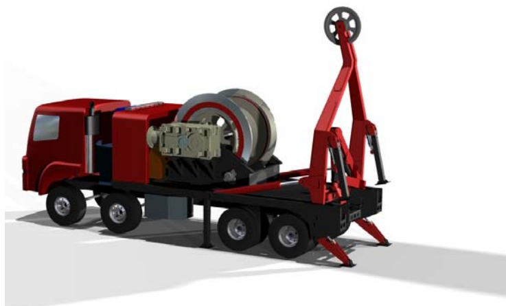
Sheave Wheel in Deployment