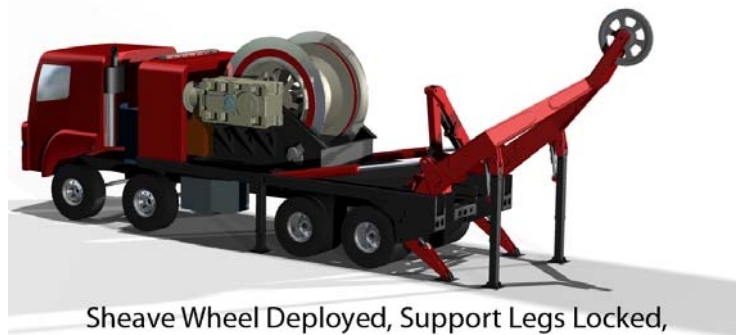
Sheave Wheel Deployed, Support Legs Locked, Winder Ready for Operation